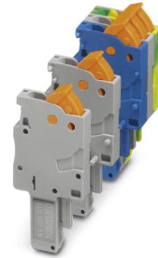
Illustration shows various versions of the product (left, center and right element) in different color combinations

http://eshop.phoenixcontact.de/phoenix/treeViewClick.do?UID=3051043